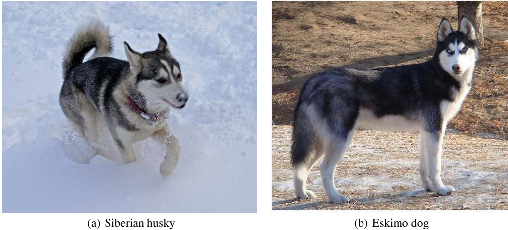
Figure 1: Two distinct classes from the 1000 classes of the ILSVRC 2014 classification challenge.

and expensive, especially if expert human raters are necessary to distinguish between fine-grained visual categories like those in ImageNet (even in the 1000-class ILSVRC subset) as demonstrated by Figure 1.